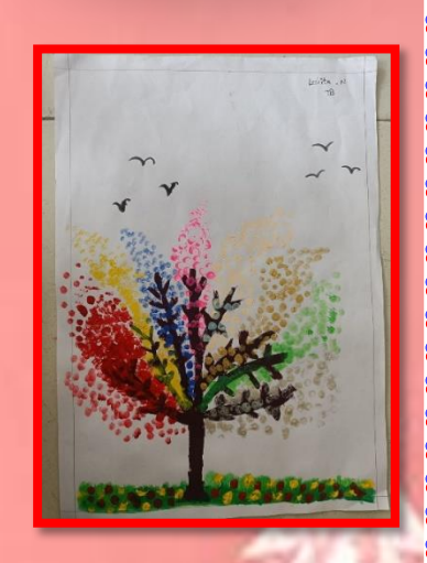
Leshita - VII B