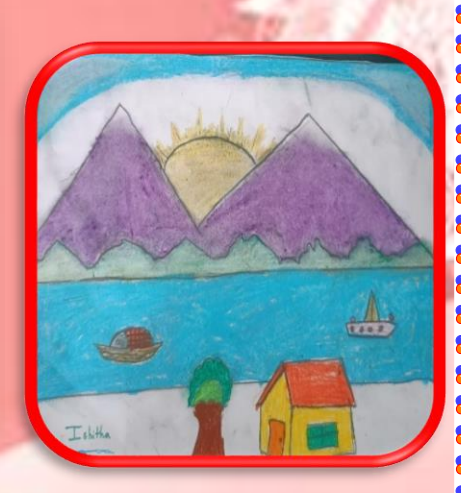
Ishita - III B