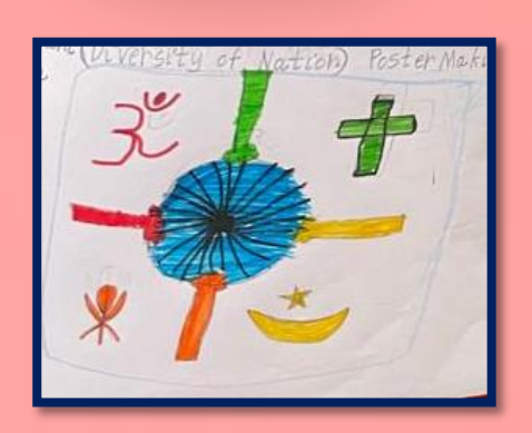
Jaivanth - IV A