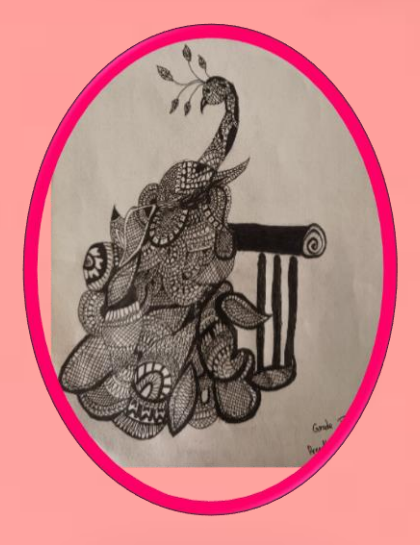
Preethi Upadhyay – VI B