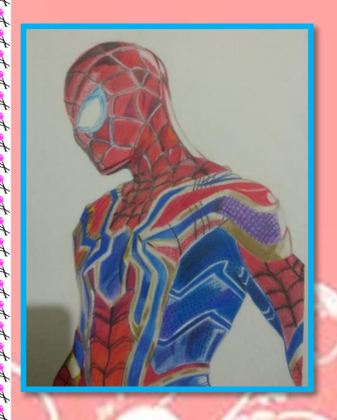
Mahesh Choudhary - VIII B