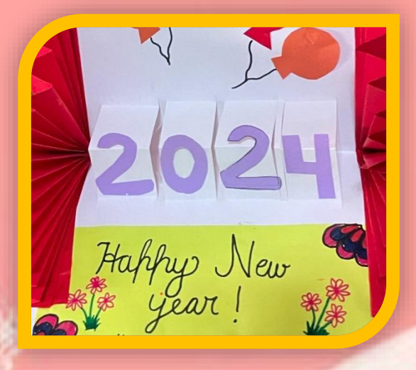
Anushree - IV B