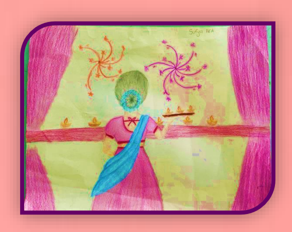
Sufya - IV A