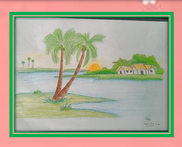
Chaitrika Lakkam - VI B